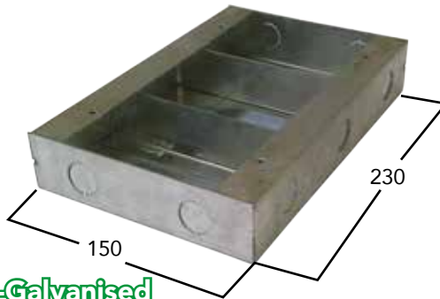
Conduit Box Pre-Galvanised