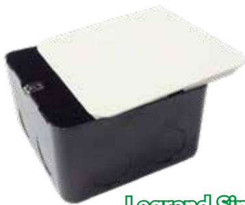
Legrand Single Pop-Up Back Box 0 540 00