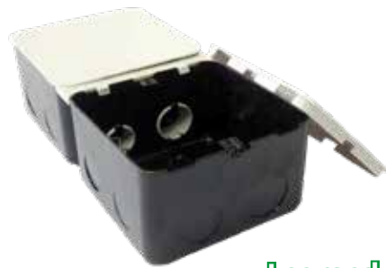
Legrand Double Pop-Up Back Box 0 540 02