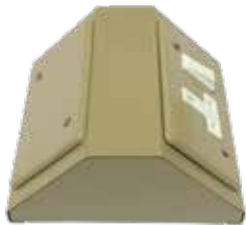
FD 6 Single & FD 6 Double Pedestal