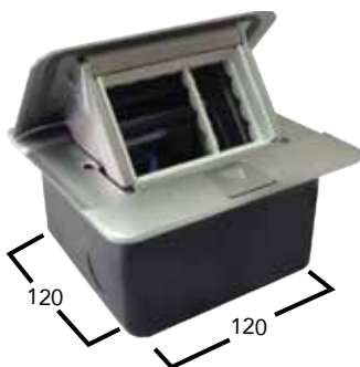
Legrand Single Pop-Up Pedestal Complete 0 540 10