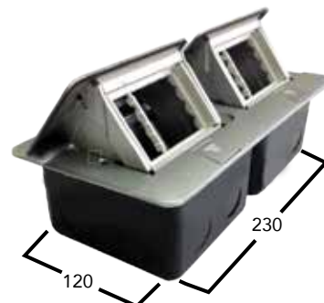
Legrand Double Pop-Up Pedestal Complete 0 540 12