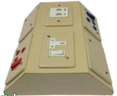
FD 9 Single & FD 9 Double Pedestal